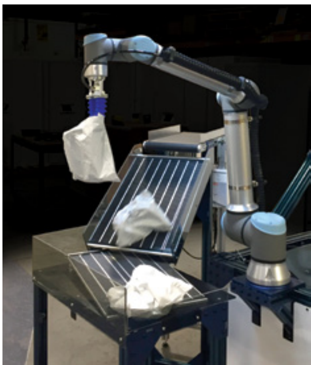
The Quick Deployment Kit from MDCI Automation identifies the pick points for items in a pick zone and sends the points to the UR cobot that picks and places each item onto a place zone/conveyor. The QDK can keep up with fast-moving conveyor speed and can learn to pick targets via human assistance through a remote alerting technology.

Cobots are designed to work with people, not replace them. Skilled workers build skilled cobot applications for the equipment and facilities they know, and cobots drive up DCL Logistics workers' value. Once a cobot had automated their most repetitive, low-skill, or unsafe tasks,