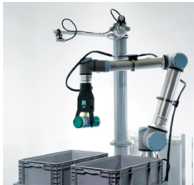
RightHand Robotics has united model-free vision, machine learning, and flexible, compliant grippers with integrated sensors to maximize throughput like in this bin-to-bin picking program.

Collaborative robots can teach themselves to pick things they've never handled before in unstructured environments like a bin or tote. Instead of storing massive data sets of 3D models for scanners and grippers to recognize, cobots use flexible grippers that combine suction,